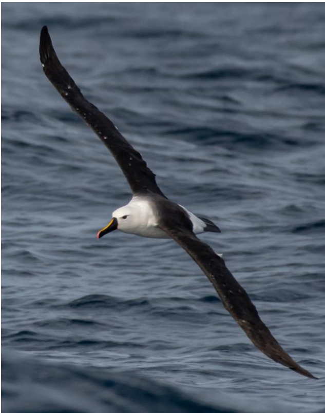
Indian Yellow-nosed Albatross