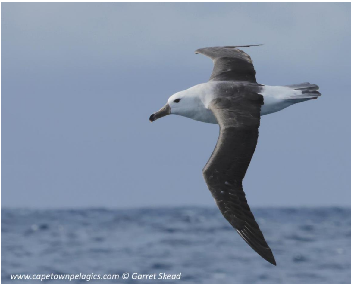
Juvenile Black-browed Albatross