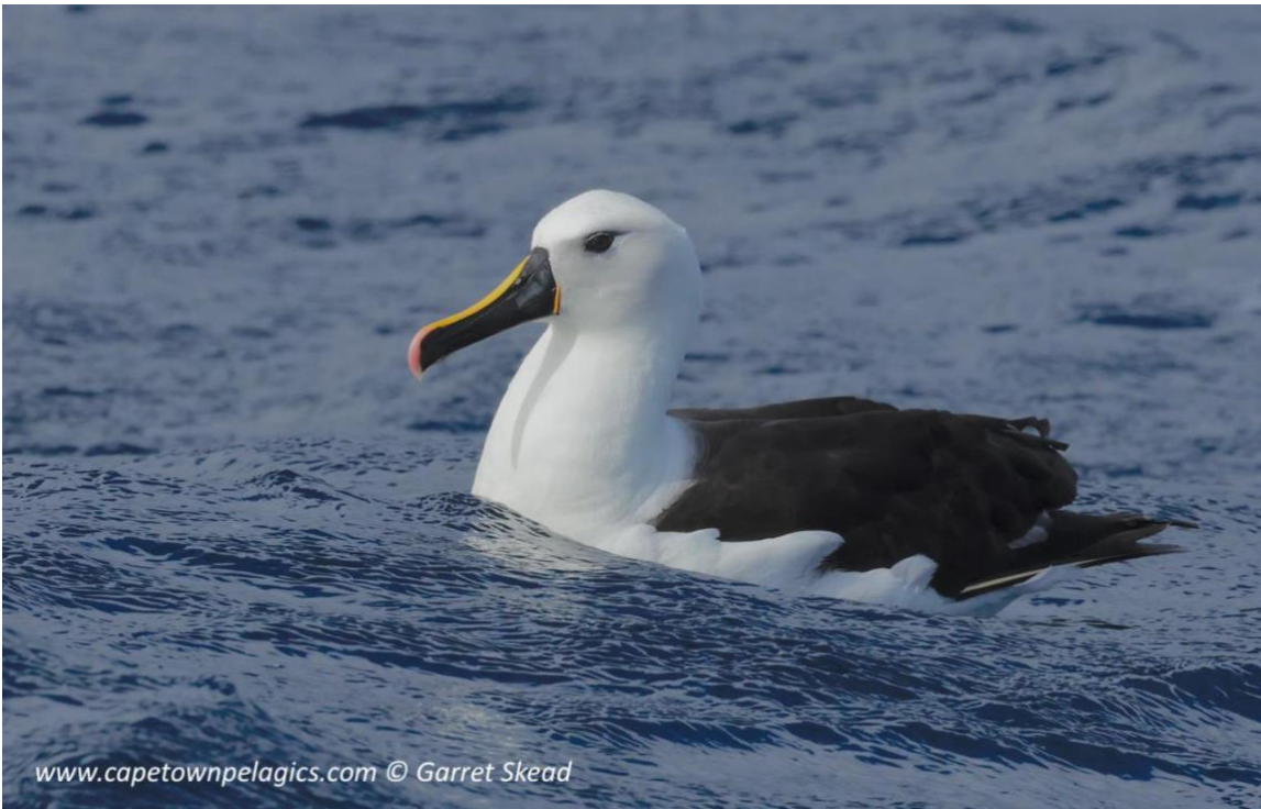
Indian Yellow-nosed Albatross